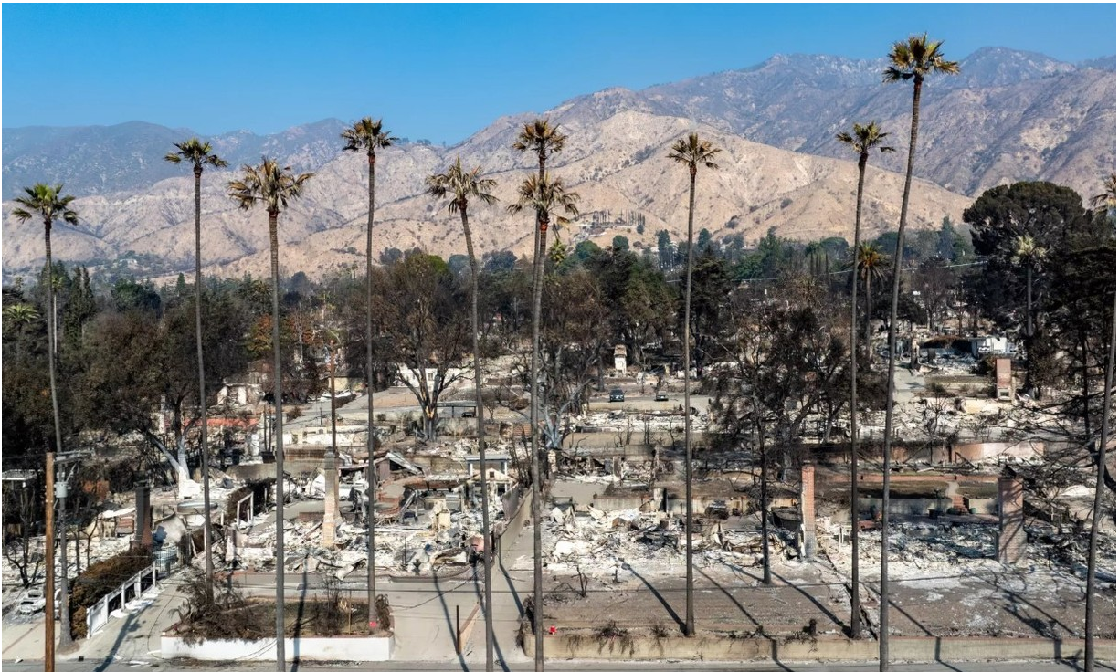
Altadena after the fires.

Last month, over two dozen fires tore through Southern California, cumulatively burning more than 57,000 acres; an area nearly equivalent to Washington, D.C. and Manhattan combined. In total, more than 16,000 homes and businesses were destroyed, according to CAL FIRE, and at least 29 people were killed. Our hearts go out to all those affected, and we especially acknowledge the destruction of the Palisades and Eaton Fires .